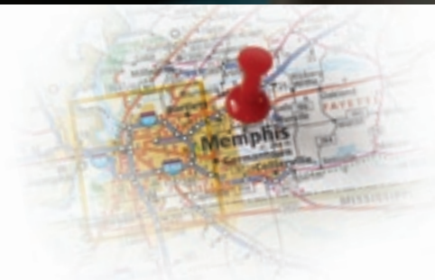
AVAYA, CARL ZEISS, DEMATIC, LAERDAL MEDICAL, SIEMENS E&A, SIEMENS MEDICAL SOLUTIONS, AND VERIZON WIRELESS RELY ON NEW BREED TO KEEP MEMPHIS OPERATIONS UNDER CONTROL.