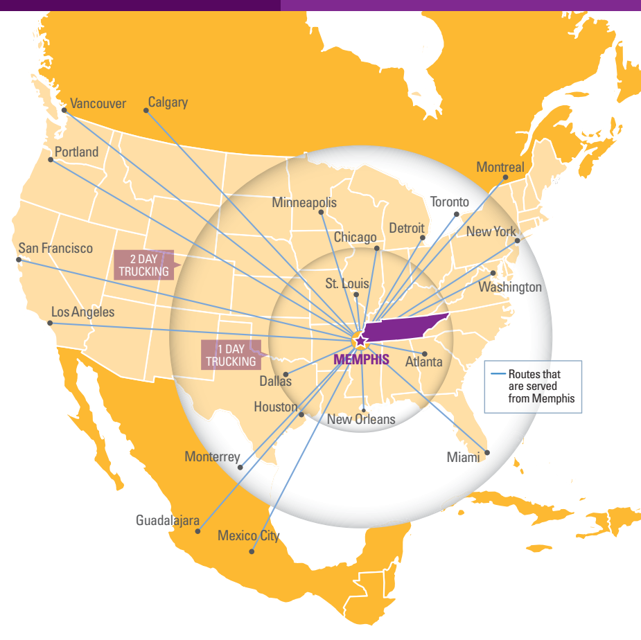
Located at the nexus of both population and transportation in the United States, Memphis serves more major metro markets overnight by truck than any other U.S. city and can reach 45 states and Canada and Mexico by ground in two days or fewer.

From CN's terminal at the Intermodal Gateway in Memphis, shipments can reach 132 metropolitan markets, representing 60 percent of the U.S. population, overnight.