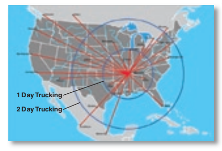
Next day delivery by truck to 40% of the U.S. population